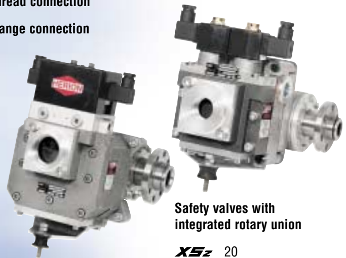
Safety valves with integrated rotary union