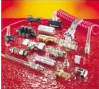
Fittings and accessories