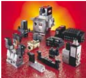
Pneumatic control and process valves