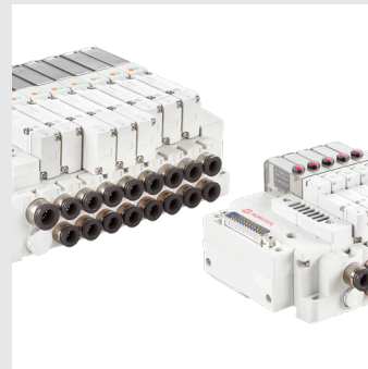
10 mm and 15 mm widths with up to 24 solenoids