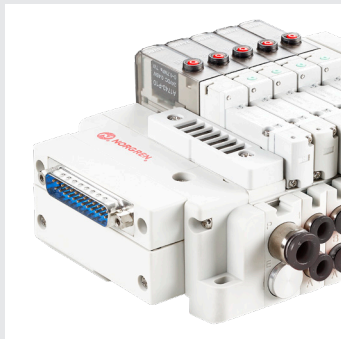
Multipole, Ethernet/IP, PROFINET, EtherCAT, and IO-Link connectivity